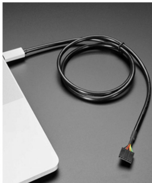
USB FTDI Chip Cable