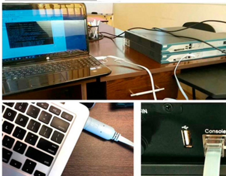
USB to RJ45 Console Cable